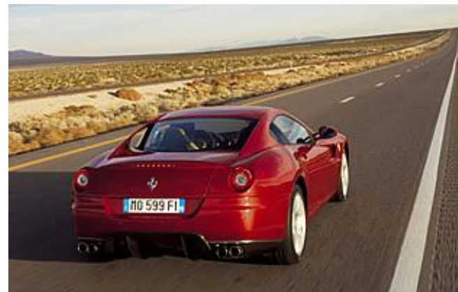
Flying buttresses are detached from the rear screen

The 599 can provide a very respectable degree of comfort, especially considering the level of performance on offer. The seats are very supportive with plenty of adjustment, while the noise levels are quite low. The ride quality is a little firmer than a conventional car, but with the manettino switch on a road-biased setting it is