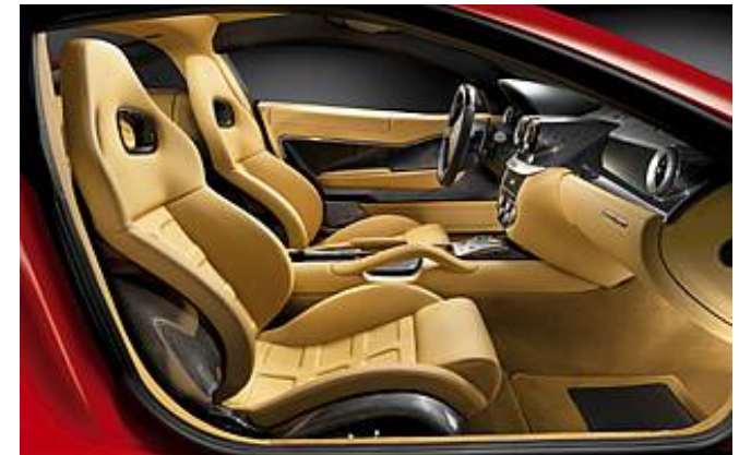
Carbon-shelled seats are supportive and highly adjustable

Petrol engine options: 6.0-litre (612bhp). Transmission options: Six-speed manual gearbox, six-speed automated