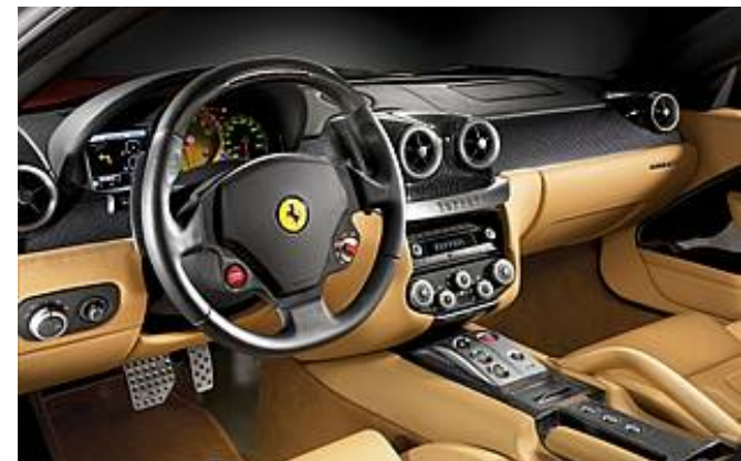
Fine materials and a classy design add up to a great cabin