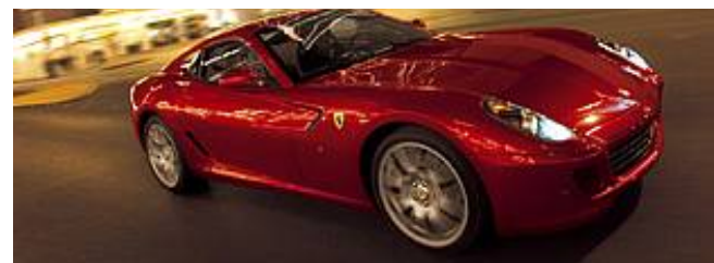
599 exterior is a mix of stylists curves and aerodynamic efficiency

Even with this focus on performance, the 599 makes concessions to comfort too. The cabin